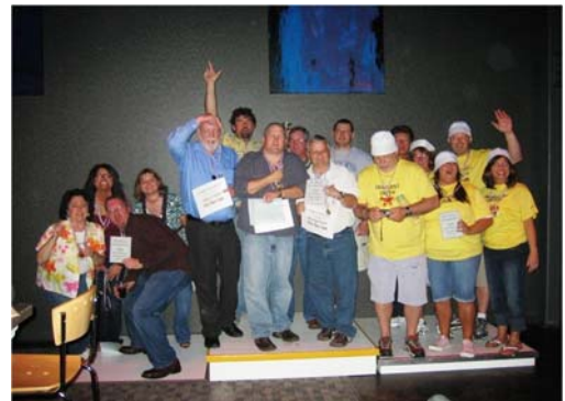
Gold, Silver & Bronze Medal Winning Teams